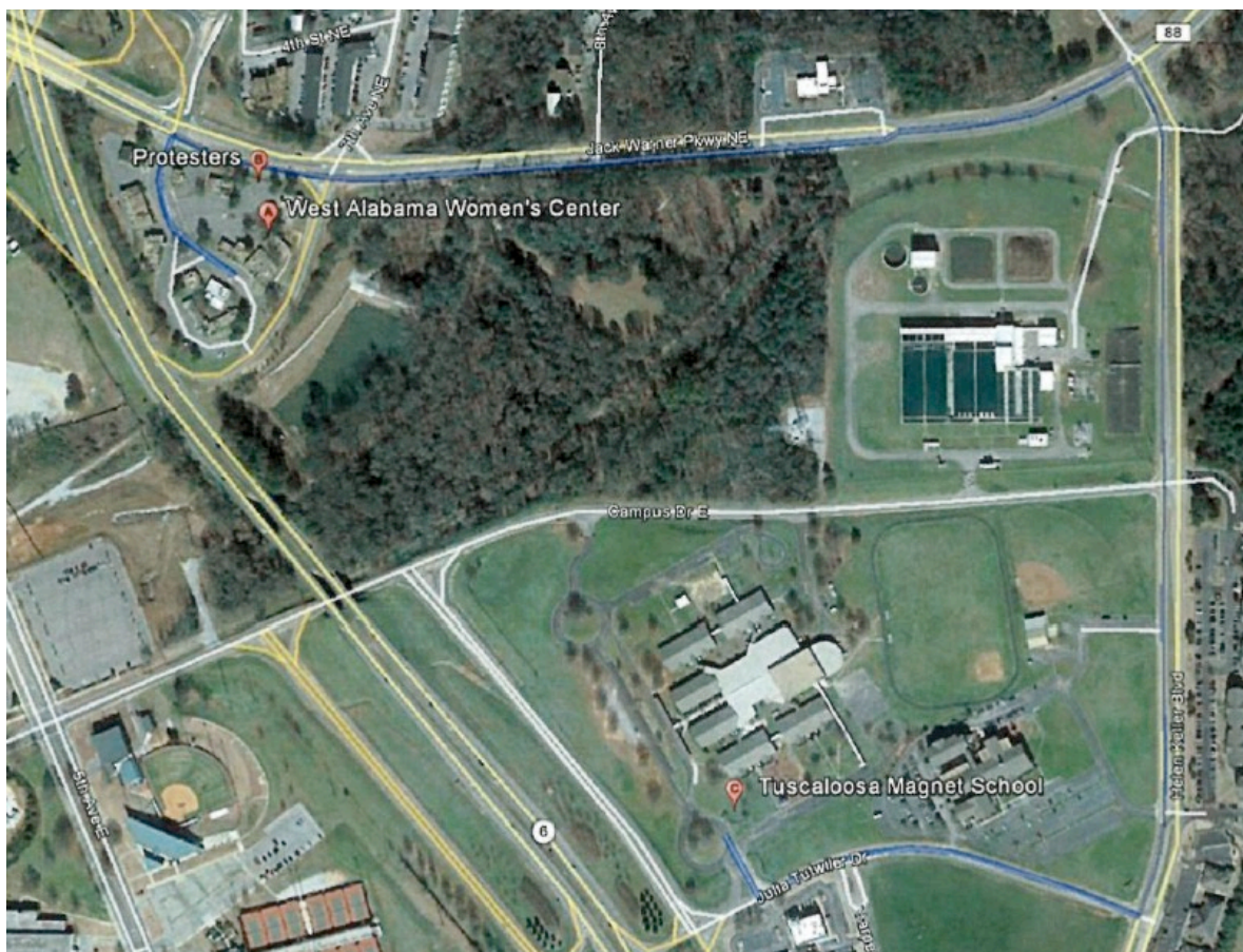
The Tuscaloosa clinic (A) and its protestors (B) are separated from the nearest school (C) by a large wooded area. Pl. Ex. 27 (excerpt).

to control their children's exposure to the subject of abortion.